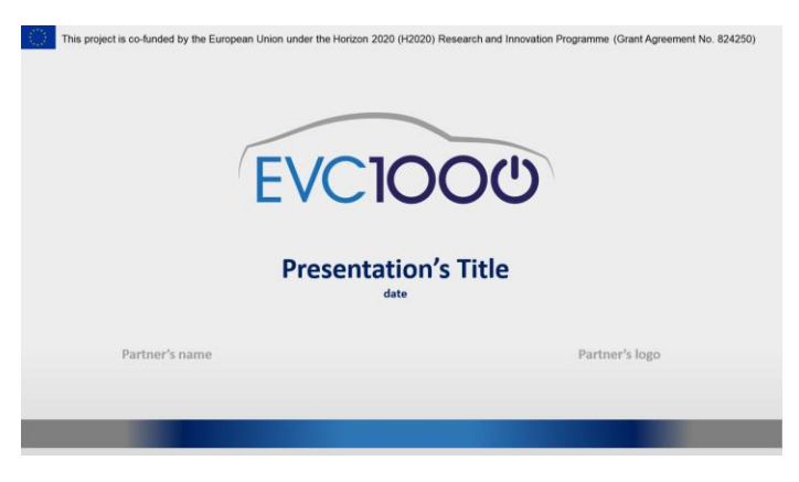
Figure 3 EVC1000 External PPT template

2. A PowerPoint (PPT) presentation template of the project has been designed for external presentations, so that they presentations can be differentiated from internal ones: